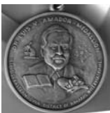
Dr. Luis V. Amador Medallion Award